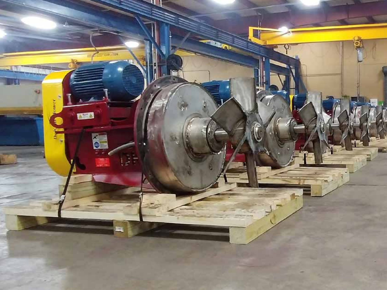
DeKalb Blower offers a variety of fans and blowers for the thermal processing industry.

often gives the OEM's applications engineer a jump start with things on their project.