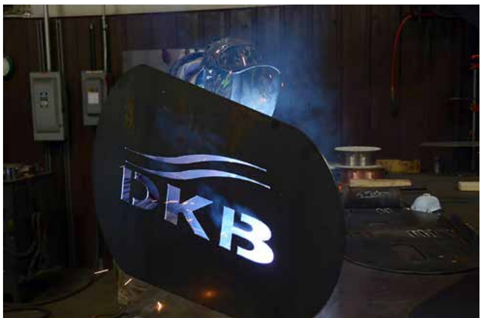
DeKalb Blower has the ability to do custom work and repairs on existing models or problem fans that may be slowing production.