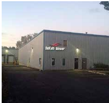
All work is performed in DeKalb Blower's 30,000-square-foot shop and done by DeKalb Blower employees.

"We've been converting a lot of older or problematic water-cooled competitions' plug fans. We've been doing a lot of air-cooling conversion to that stuff. That's a good maintenance eliminator right there. The furnace companies like it, because they can eliminate problematic water and the maintenance that comes with it. If they've got blocked water passages and then it backs up and the fan fails or overheats, we can convert that over and eliminate the water cooling altogether if the parameters are right."